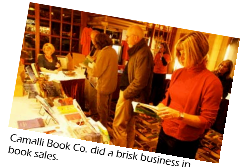
Camalli Book Co. did a brisk business in book sales.