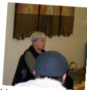
Ursula K. Le Guin