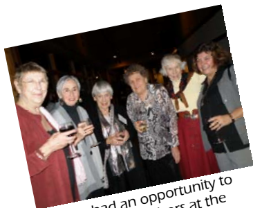
Guests had an opportunity to chat with the authors at the author dinner and panel.